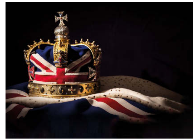
Here's a summary of the key points relevant to charities and voluntary organisations:

The King's Speech for the new Labour government outlined the draft laws the government plans to introduce, reflecting their priorities, particularly those outlined during the general election campaign.